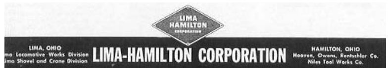
This ad appeared in the January 24, 1948 issue of Railroad Age

ue to explore all possible ways of improving such locomotives. We will continue to build them with the traditional fineness of design and manufacture that is responsible for Lima's world-wide reputation. And we will continue to believe that there is a place for these locomotives—for such modern power as the 2-6-6-6's we are now building as our fifth order for the C&O.